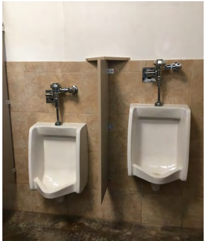
Urinals in men's restroom