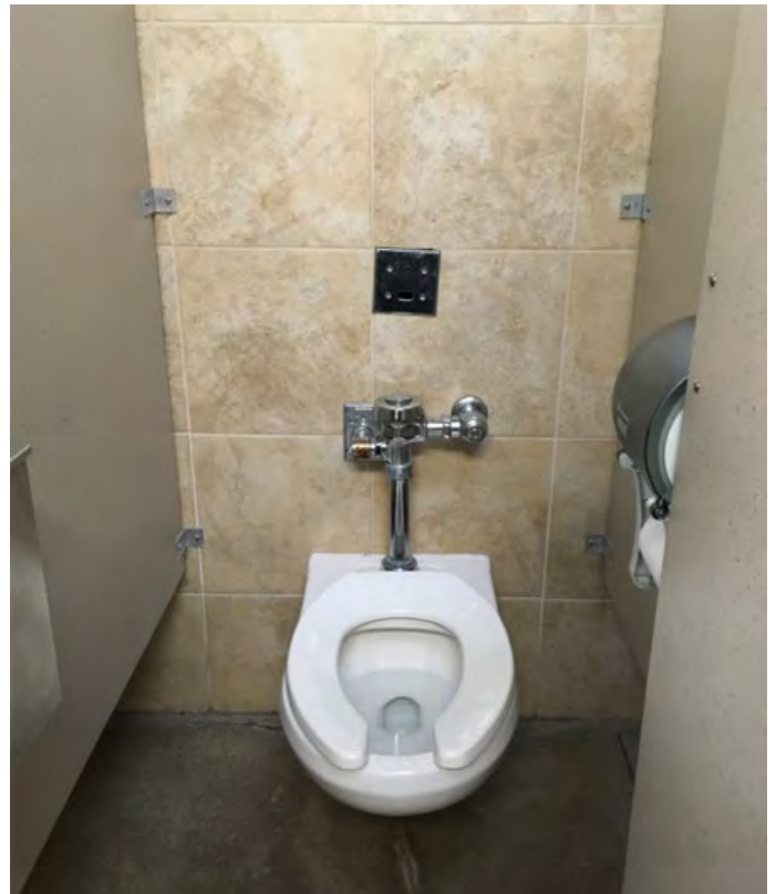
Toilet in women's restroom